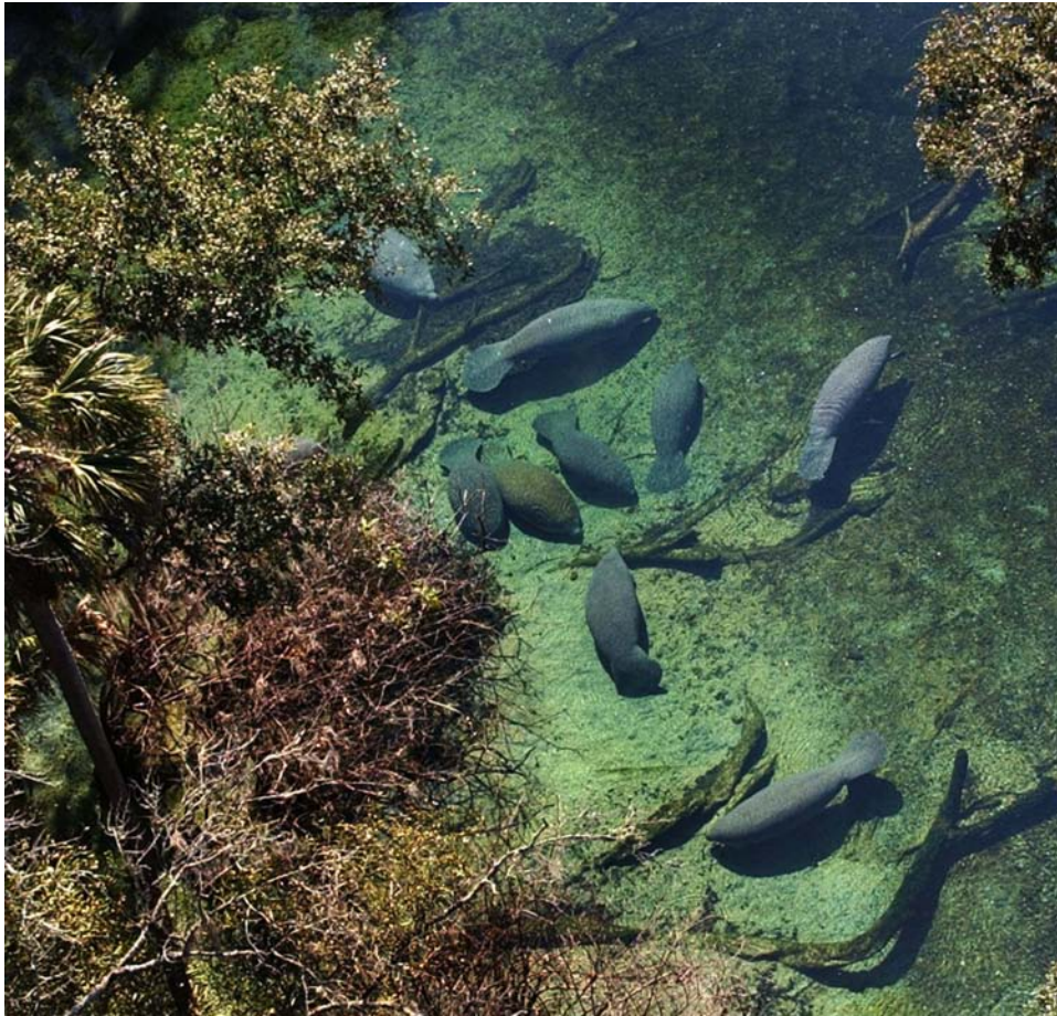
Figure 2. Florida manatees aggregating at Blue Spring, Volusia County, Florida to thermoregulate.

If major power plant outfalls or warm-water springs are lost, manatees may be unable to find suitable alternative habitats. For example, during the winter of 1989–90, most of the record number of cold-related deaths that year occurred in a northern Florida County (Brevard) where manatees depend on two power plant outfalls. Apparently, during an exceptionally cold period in the last week of 1989, the plants were unable to maintain outfall temperatures warm enough to support all animals. When the outfall temperatures fell to potentially lethal levels, manatees nonetheless stayed in the area and failed to move to suitable alternative sites further south. Had the plants not operated at all and outfall temperatures fell even further, cold-related deaths likely would have been substantially higher that winter.